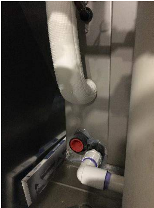
AC connection at furnace