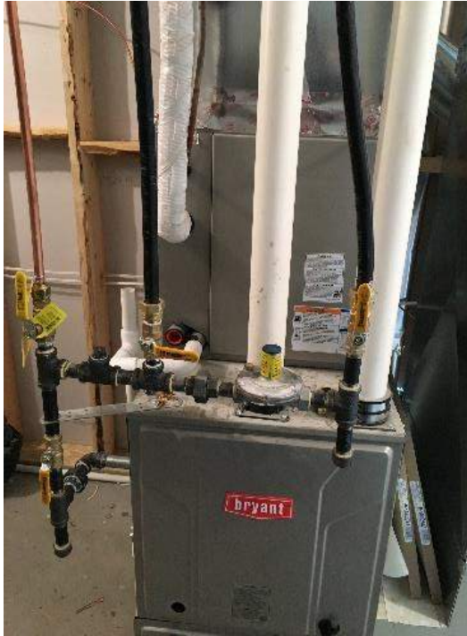
Furnace front and gas piping