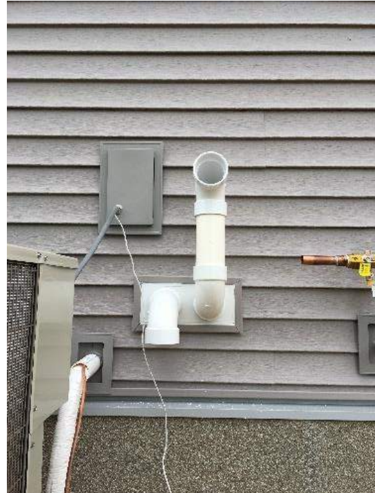
Furnace exterior venting